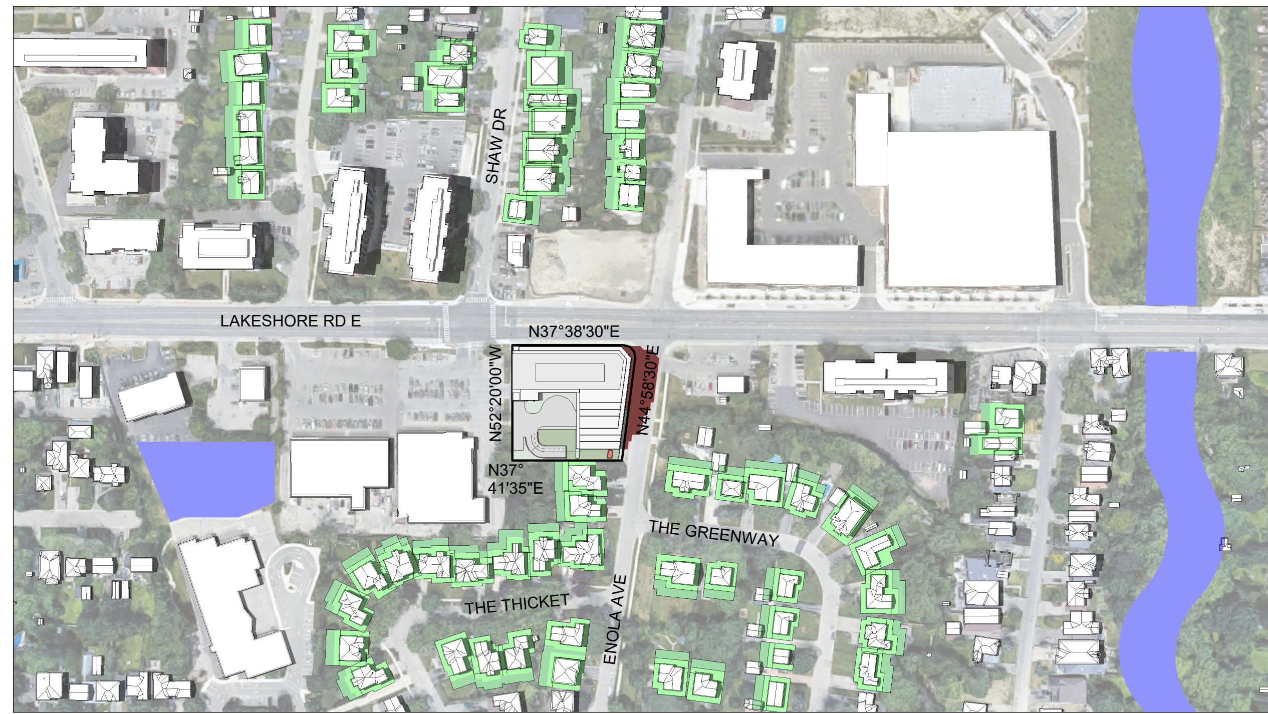
JUNE 21 - 13:20

This drawing, as an instrument of service, is provided by and is the property of Turner Fleischer Architects Inc. The contractor must verify and accept responsibility for all dimensions and conditions on site and must notify Turner Fleischer Architects Inc. of any variations from the supplied information. This drawing is not to be scaled. The architect is not responsible for the accuracy of survey, structural, mechanical, electrical, etc. information shown on this drawing. Refer to the appropriate consultant drawings before proceeding with the work. Contractor must conform to all applicable codes and requirements of all relevant taxing jurisdictions. The contractor must ensure full responsibility and bear costs for any corrections or damages resulting from his work.