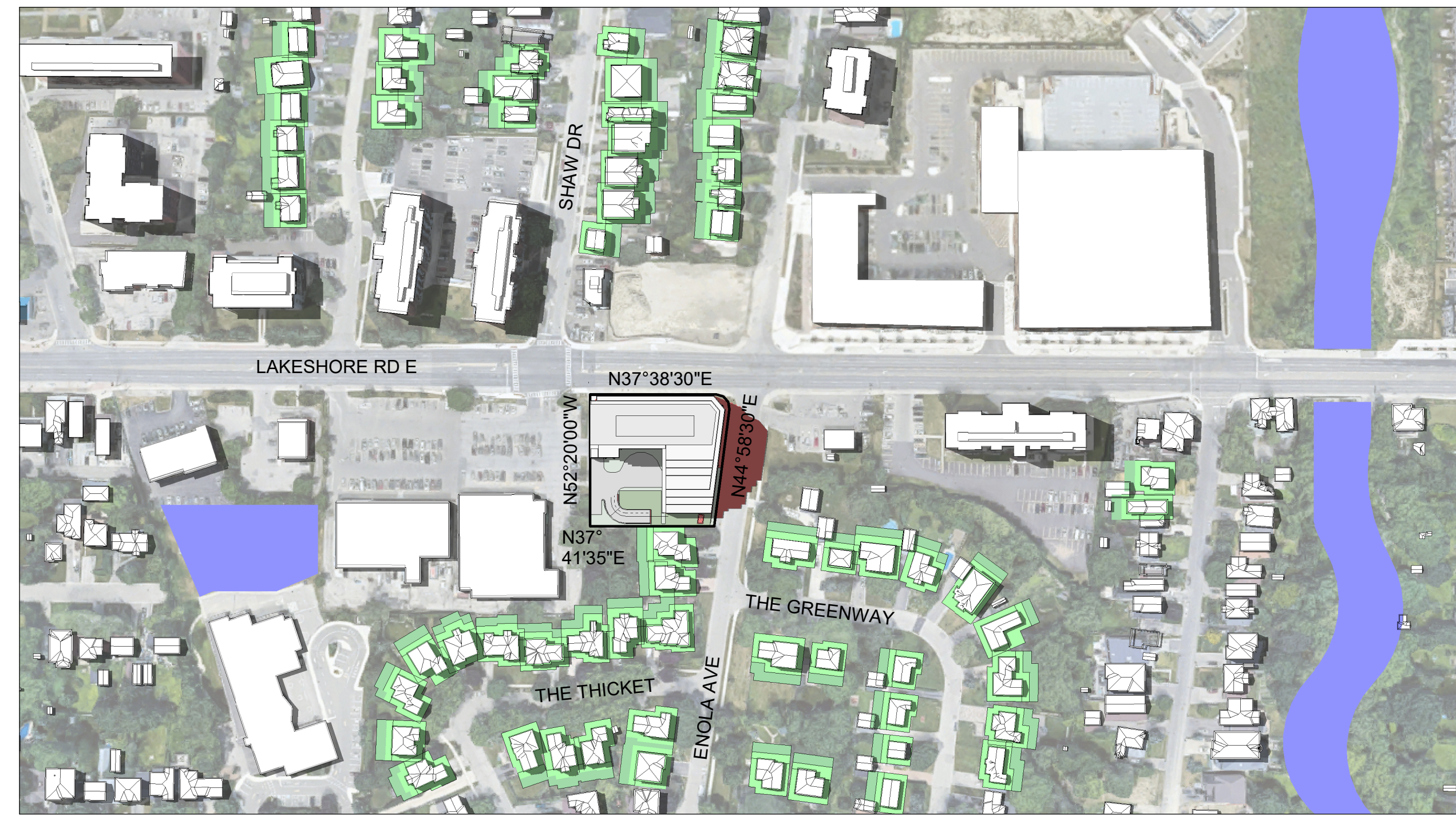
JUNE 21 - 14:20