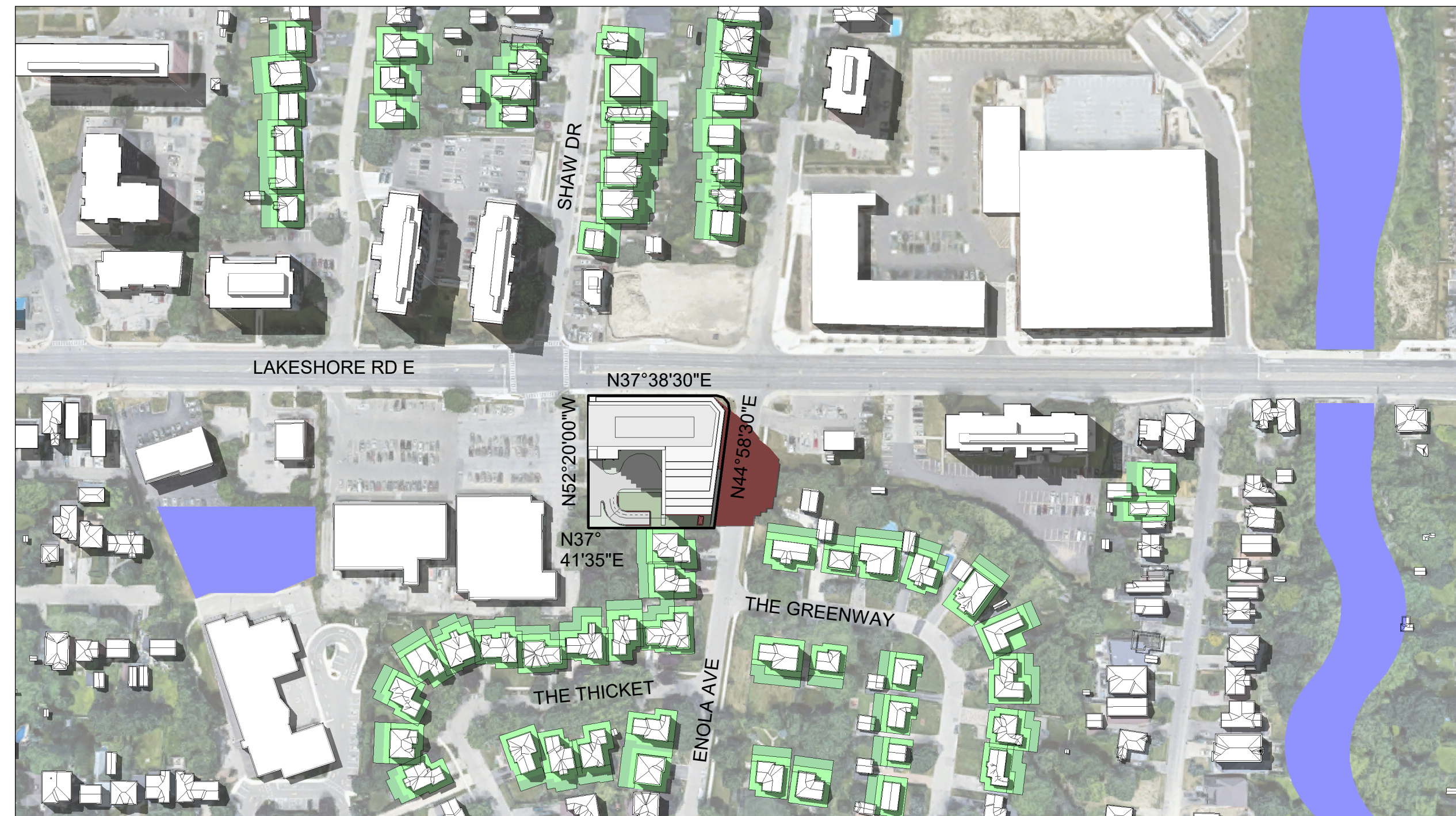
JUNE 21 - 15:20